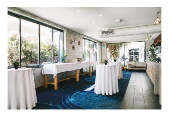
Located behind the sports bar, this function space is close to the main bar and all amenities. Perfect for small intimate gatherings